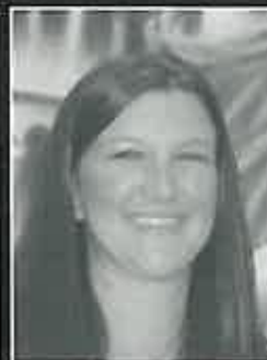
Nicole Wheeler Documents